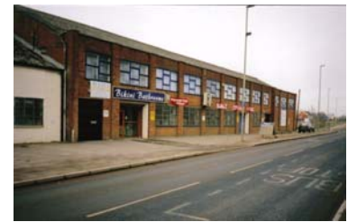
The City Business Centre, from South