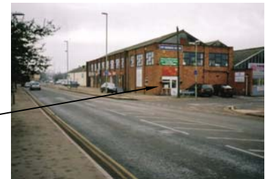
The City Business Centre, from North

Coffee / sandwich bar on corner of office block.